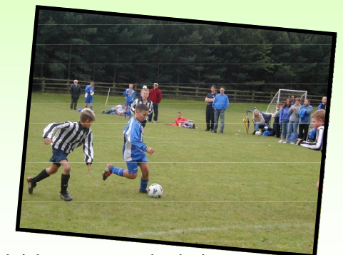
Above: left: Play Equipment and right: young people playing football on one of the football pitches