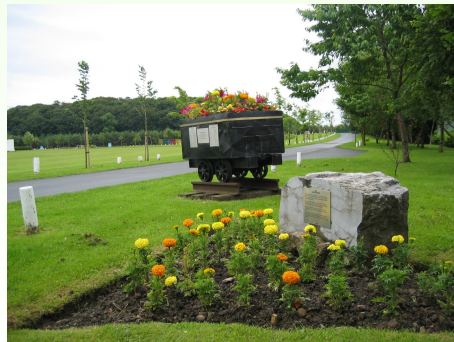
Left: Floral display at Bowls Pavilion and Right: Memorials, flowerbeds and trees