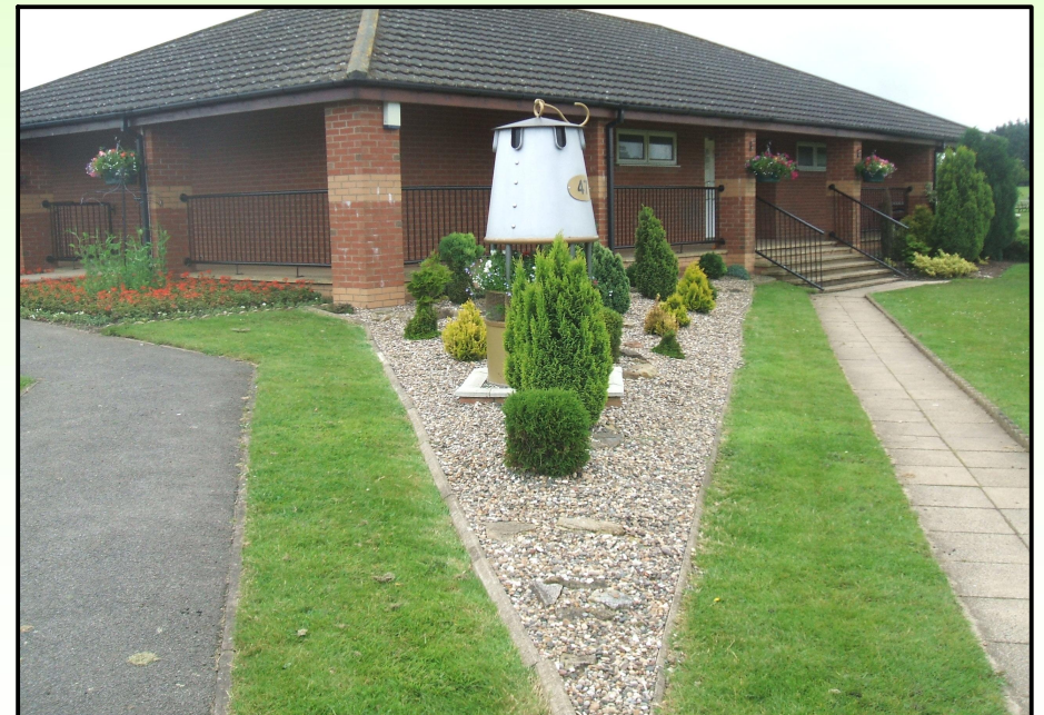
Mainsforth Bowls Pavilion