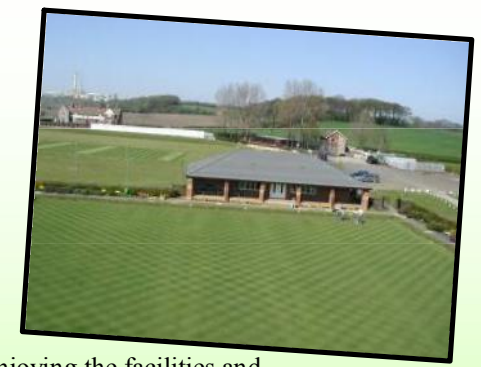
Above: left: Cricketers enjoying the facilities and right: The Bowls Pavilion and Green